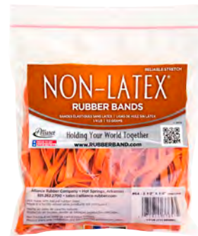
1/4 LB POLY BAG