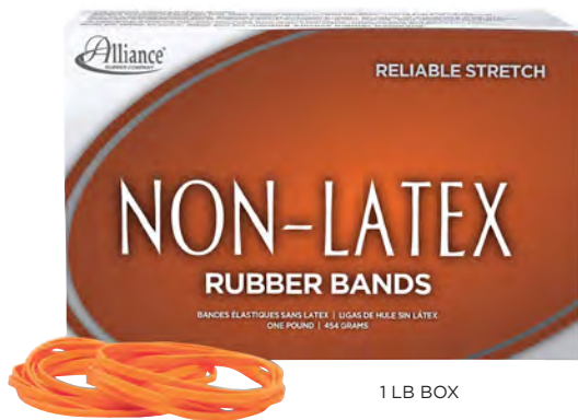
1 LB BOX