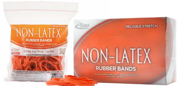
1/4 lb. Poly Bag

The rubber band for people who suffer from latex allergy reactions. It is made from synthetic rubber and is recommended for home, school, workplace, government, and medical facilities. It is a bright orange color for easy identification.