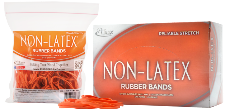
1/4 lb. Poly Bag

The rubber band for people who suffer from latex allergy reactions. It is made from synthetic rubber and is recommended for home, school, workplace, government, and medical facilities. It is a bright orange color for easy identification.